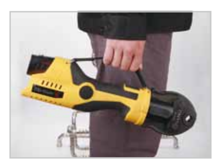
Easy to carry from site to site