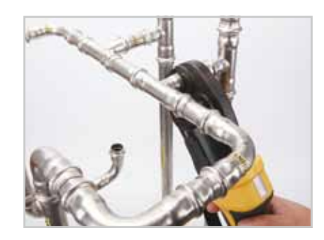
Easy use in confined spaces