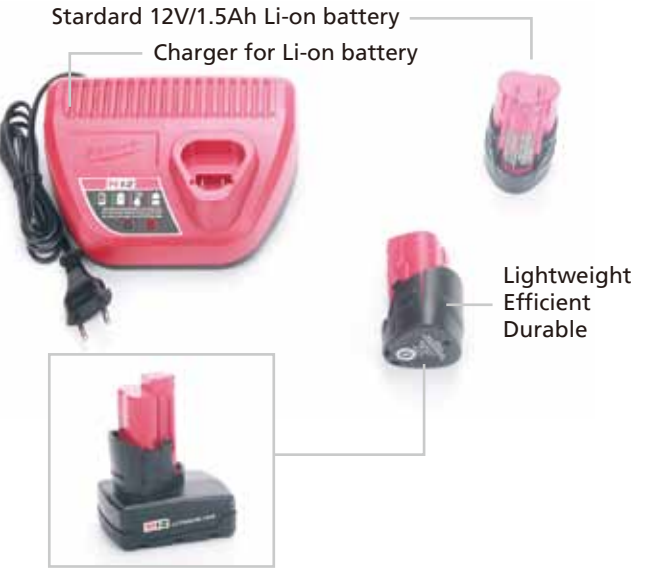
Optional powerful 12V/3.0Ah Li-on battery