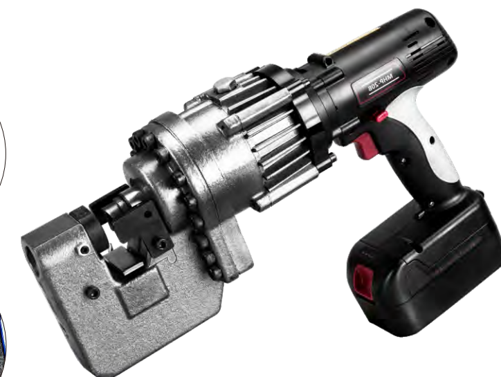
MHP Portable Hydraulic Punching Machine