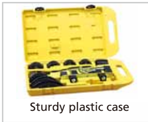
Sturdy plastic case