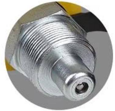
NPT 3/8 Male Coupler