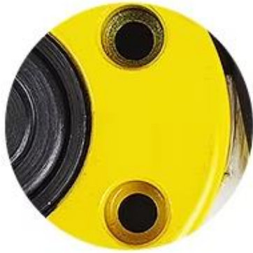
With two holes