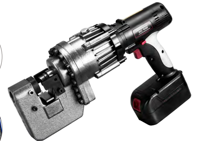
MHP Portable Hydraulic Punching Machine