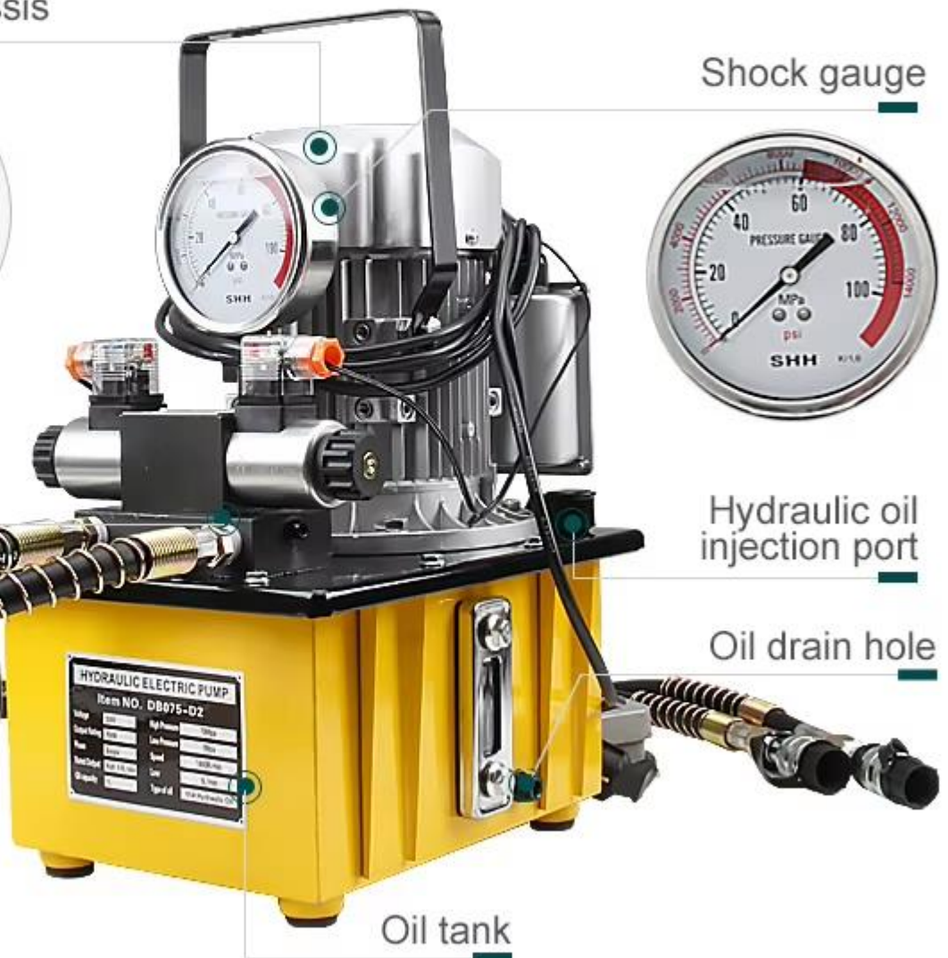
Oil drain hole