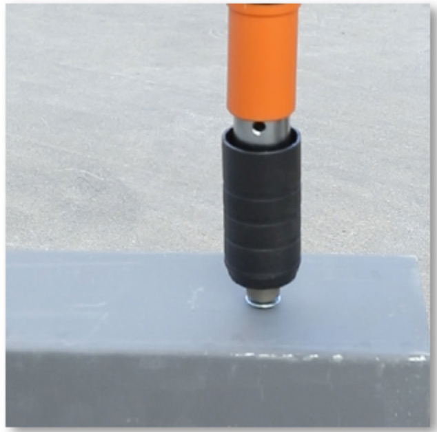
4. It can be penetrated with a slight push