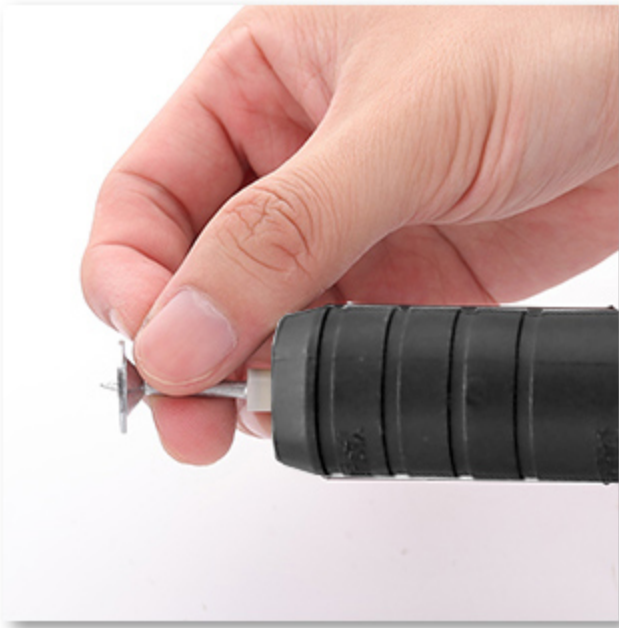
1. Choose a good nail