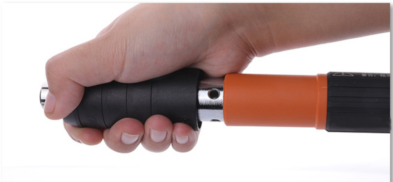
5. Manual slag removal operation, convenient for the next shot