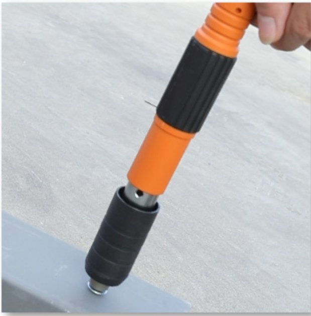
3. The muzzle is vertically aligned with the pipe